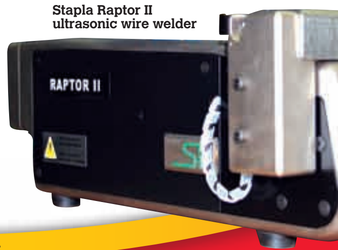
Stapla Raptor II ultrasonic wire welder