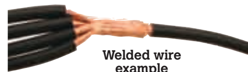
Welded wire example