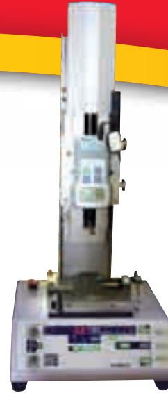
Pull Force Gauge