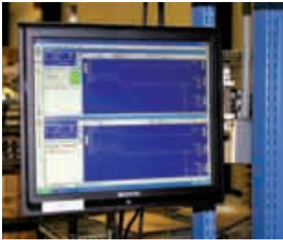
Cable Eye Testing