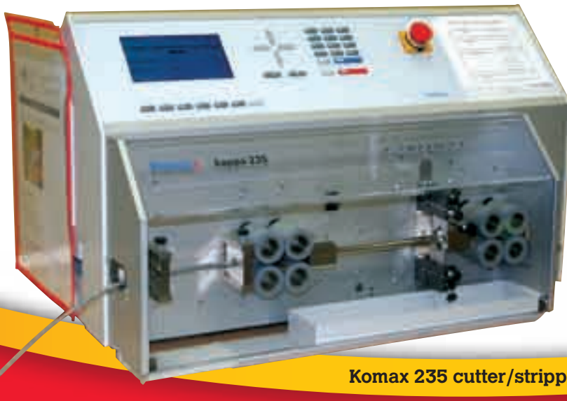
Komax 235 cutter/stripper