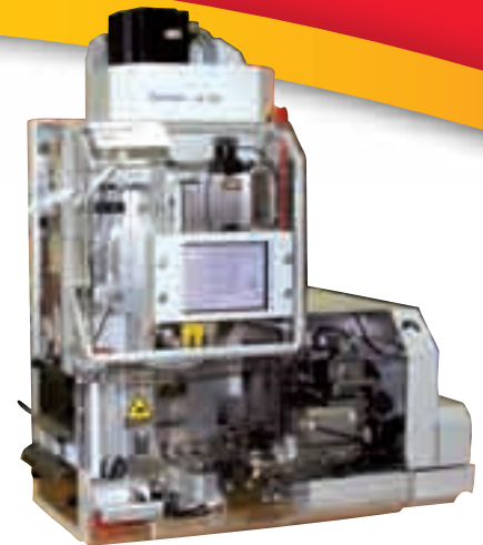
Komax BT 722 wire terminal crimper with crimp force technology