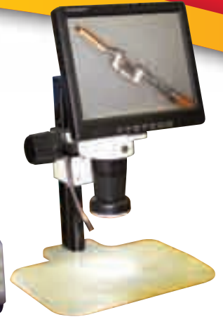
LCD Video Microscope